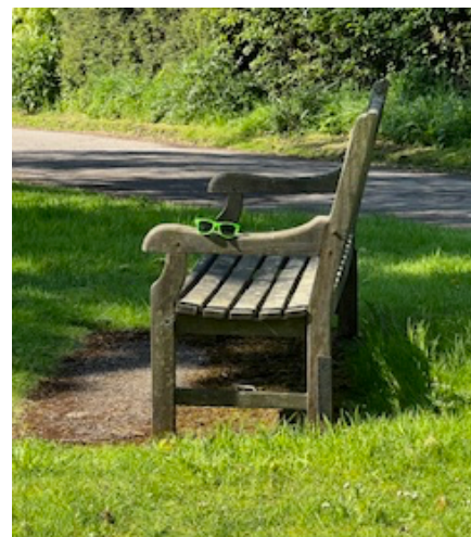
Keeping an eye on the village green

To view catalogue visit the Suffolk Archive website, www.suffolkarchives.co.uk . then insert either HD3083 or 'The Joan Peck collection' into the search engine and have a browse of this invaluable parish collection.