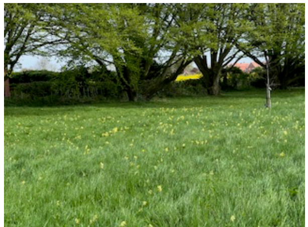
Cowslips in the church flower meadow