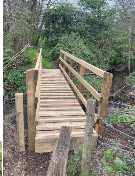
new Byng Brook Bridge

The roadside finger post has been broken, and the path access from the road is completely overgrown by brambles and the hedge. Ref 467254 (pictured). Ref 467245 reports the very muddy state of the access to the footpath to Grove farm from Byng Lane.