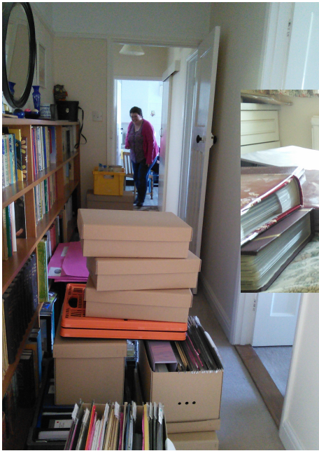
Squidgy has gone to another good home