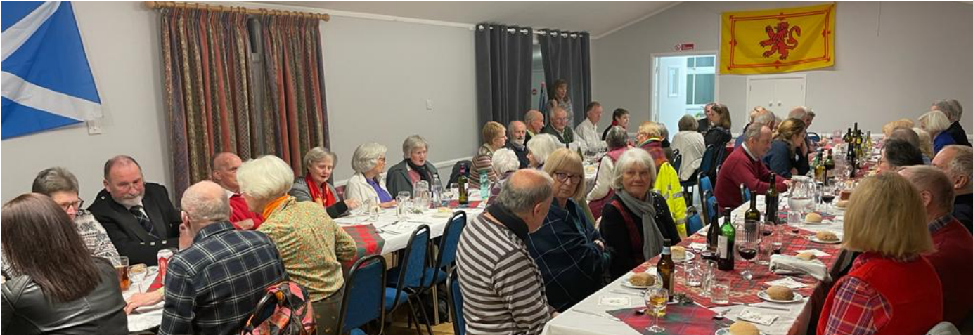
“The wide world is all before us – but a world with friends” ...sorry Rabbie