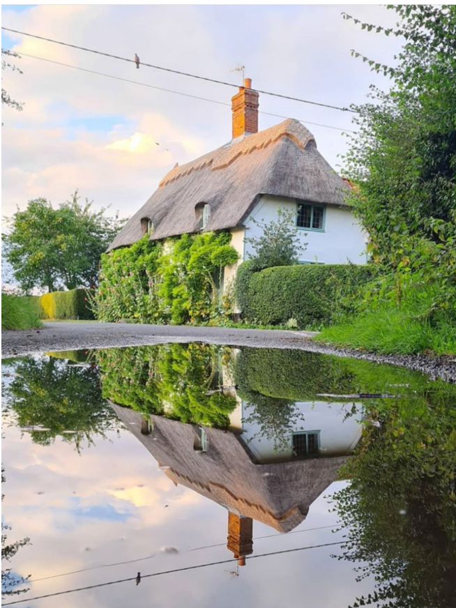
Surprising what you can find in a puddle— Double Rogues Cottage!