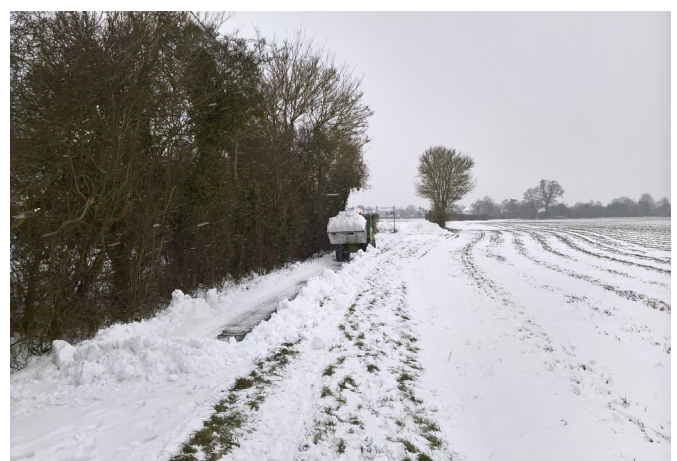
Clearance under way