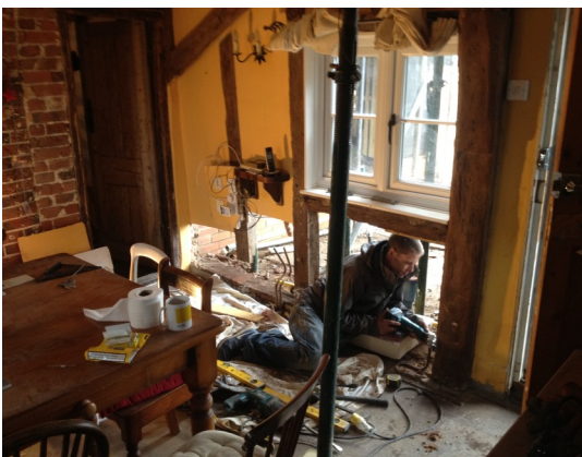
Big holes in the walls!