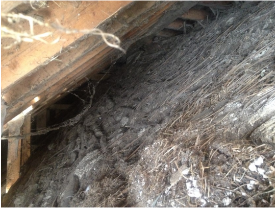
Old thatch under present tiled roof