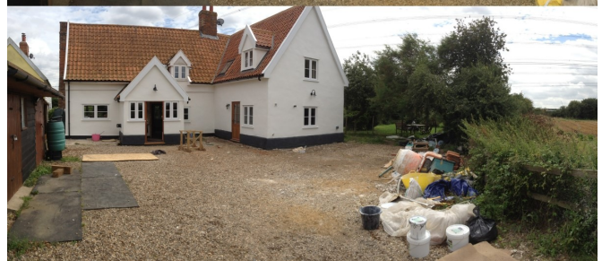
Montage showing progress of the build