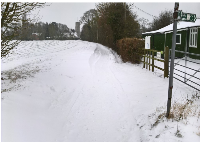
Walnuts Lane blocked