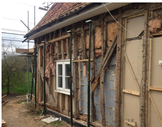
Just about standing up