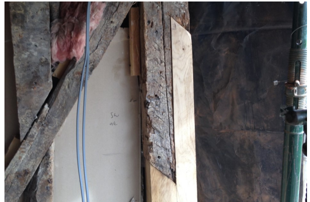
Cutting the new oak into the old