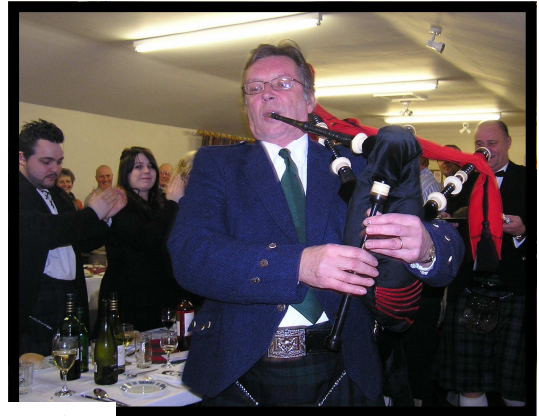
Piping in the Haggis