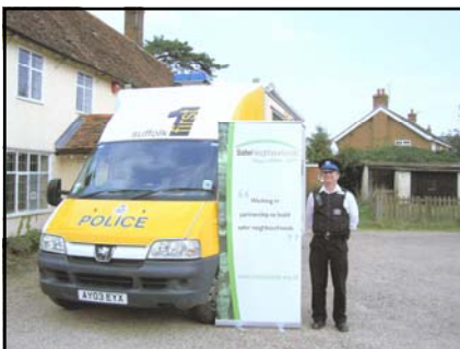
A police Community Support Officer has a blue hat band